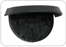
DOMCOVER Combined ceiling mount and weather cover bracket