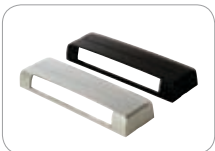
HR94D-COV/S Silver sensor cover HR94D-COV/BL Black sensor cover