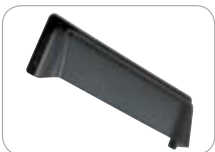
WC/BL Black weather cover