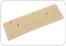
1200R Spacer for installation on a round door